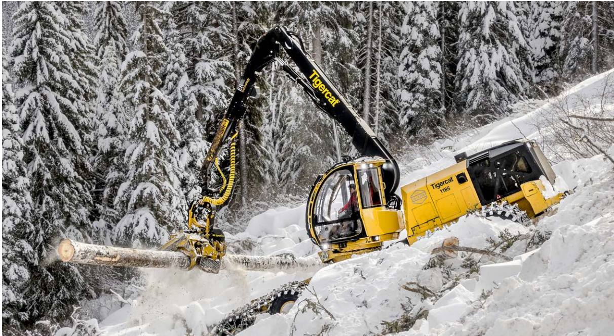
1185 Harvester

For more information and to watch the video visit, www.renishaw.com/tigercat