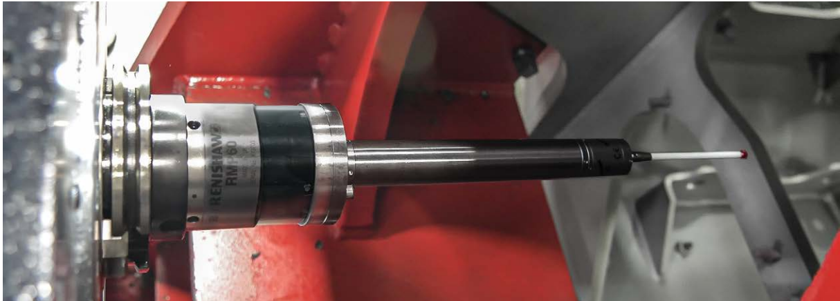
Renishaw RMP60M machine tool probe