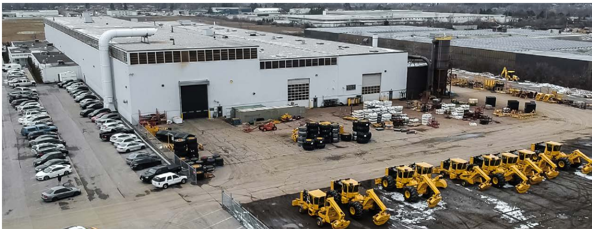
Tigercat Industries Inc. - Cambridge, Ontario, Canada.

It has led to improvements across the board, in terms of machine cycle times, part quality and operator safety. It is also being used for machine health checks, giving Tigercat even greater confidence that all of its production processes are perfectly up to specification.