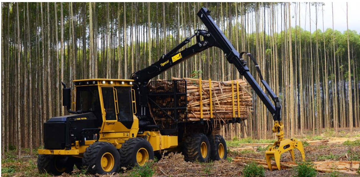
1075 Forwarder

Designed to aid workpiece set-up and inspection on multi-tasking machines and machining centres, the flexible RMP60M spindle-mounted radio transmission probe was deployed by Tigercat throughout its Cambridge production line. Drawing on Renishaw's wide range of compatible ceramic stem and ruby ball styli, the company was able to develop automated set-up solutions, customised to meet the specific demands of Tigercat's many large and varied workpieces.