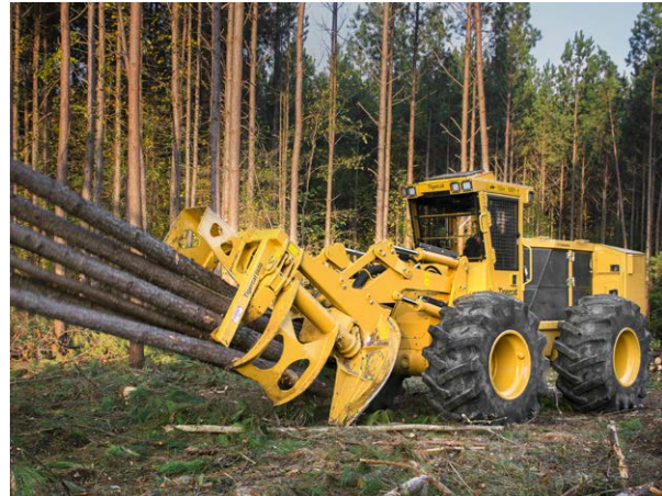
724G Feller Buncher

The integration of Renishaw's high-accuracy radio transmission probes into Tigercat's production processes has seen workpiece set-up times reduce by 75%. Manual set-ups that once took an hour have been replaced by automated set-ups that take 10-15 minutes.